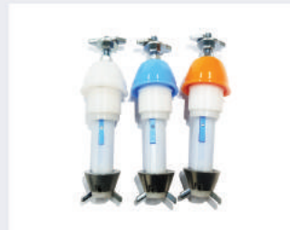
Bobbin Holder for ZINSER R/F