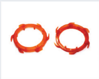
Clipping Device for RIETER R/F