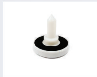
Peg Tray Assy for RIETER R/F - Part Code : YMS-RC110