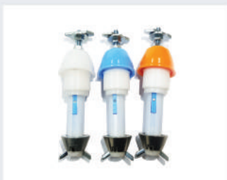
Bobbin Holder for RIETER R/F - Part Code : YMS-EE109