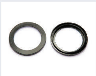
Gliding Ring for RIETER R/F