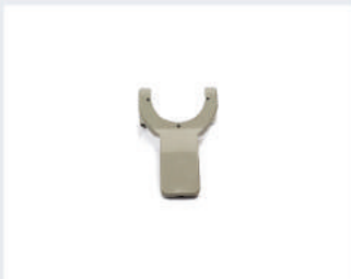
Hand Brake for RIETER R/F - Part Code : YMS-RE504