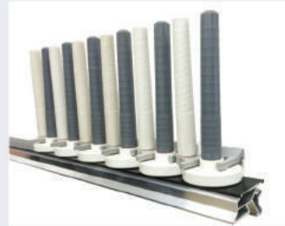
New Tray Rail for RIETER R/F - Part Code : YMS-RE600