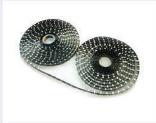
Conveyer Belt Assy for TOYOTA R/F