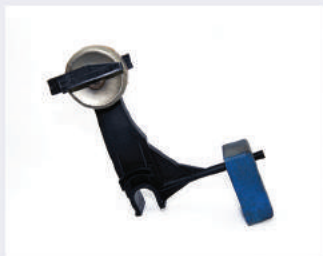
Tension Device Assy for TOYOTA R/F