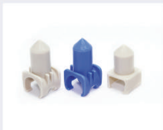
Middle Peg for TOYOTA R/F