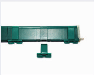
Suction Flute Assy for HOWA R/F