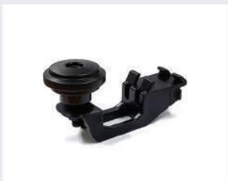
CV Guide for RIETER R/F - Part Code : YMS-RE162