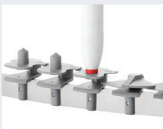
Conveyer Belt Assy for ZINSER R/F