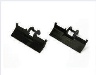
Cradle for RIETER R/F