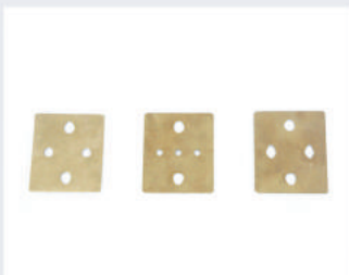
Conveyer Belt Lock for RIETER R/F