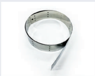
Steel Strip for RIETER R/F - Part Code : YMS-RC110