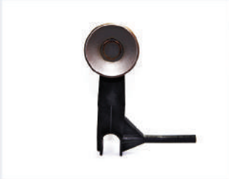
Tension Device Assy for HOWA R/F