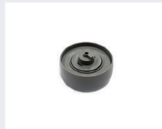
Jockey Pulley for RIETER R/F