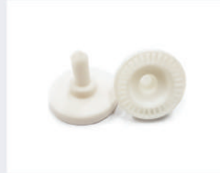
Peg Tray for ZINSER R/F