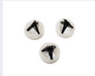
Peg Tray Brush for TOYOTA R/F