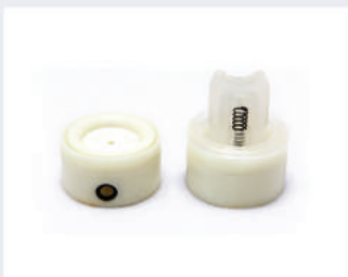
Pallet for HOWA R/F Gripper