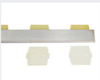
Pad Cleaner Assy for HOWA R/F