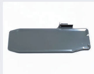
Separator for RIETER R/F - Part Code : YMS-RE502