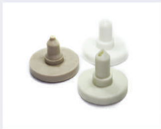
Peg Tray for TOYOTA R/F