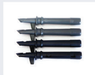
Suction Pipe for RIETER R/F - Part Code : YMS-RE110