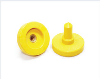
Peg Tray for HOWA R/F