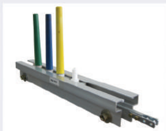
New Tray Rail for TOYOTA R/F