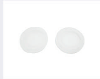
Diaphragm for TOYOTA R/F