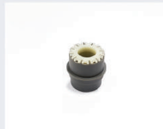
Clamping Crown for RIETER R/F - Part Code : YMS-RE501