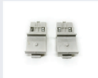
Carrier Bottom for RIETER R/F - Part Code : YMS-RC130