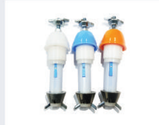
Bobbin Holder for LMW R/F