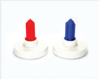
Peg Tray Assy for RIETER R/F - Part Code : YMS-RP100