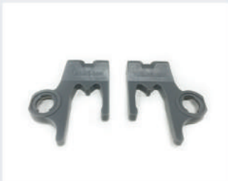
Carrier Top for RIETER R/F - Part Code : YMS-RC120