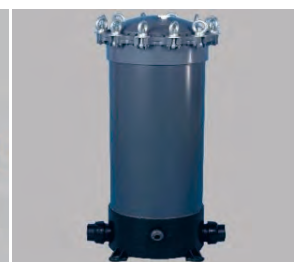
PlasFlow UPVC Cartridge Housing